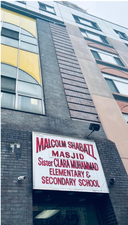
The Malcolm Shabazz Masjid in Harlem