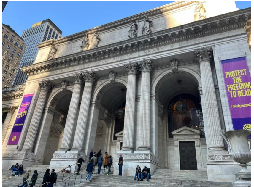
The New York Public Library: Schwarzman Building